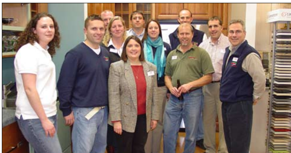
The crew from Hancock Lumber hosted our November Business Break at their showroom on the Rotary in Windham. Proceeds from the 50/50 raffle will benefit the Maine Handicapped Skiing Association.

Many of the youth who attended helped deliver the items to the winners. Great job by all! We provide one of the best Chinese Auctions in the Region, and every year we welcome back the many followers who look forward to this popular community event.